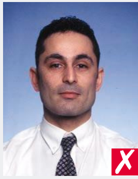
too far away