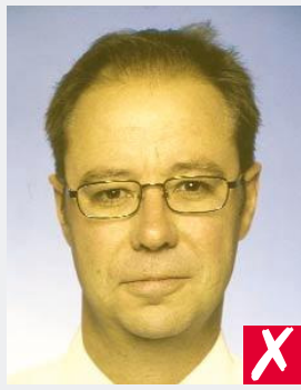
unnatural skin tones