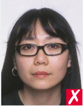
frames too heavy