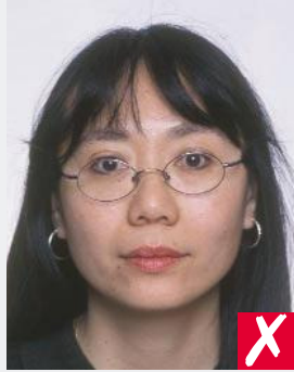
frames covering eyes