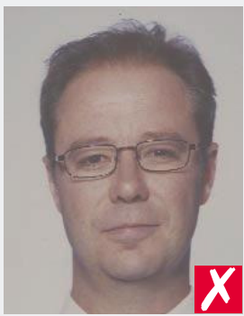
washed out colour