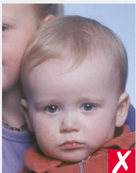
shows another person