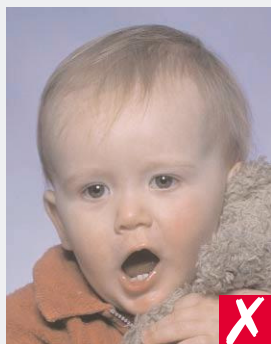
mouth open and toy too close to face