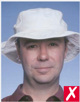
wearing a hat