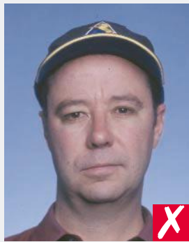
wearing a cap