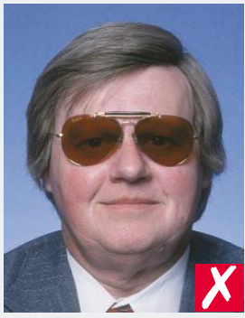
dark tinted lenses