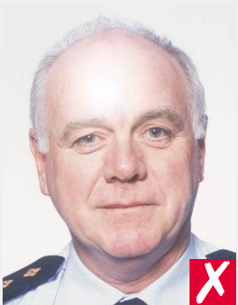
flash reflection on skin