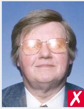
flash reflection on lenses